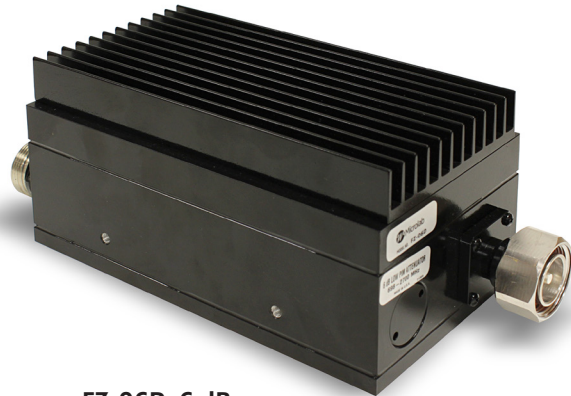
FZ-06D, 6 dB Low PIM Attenuator