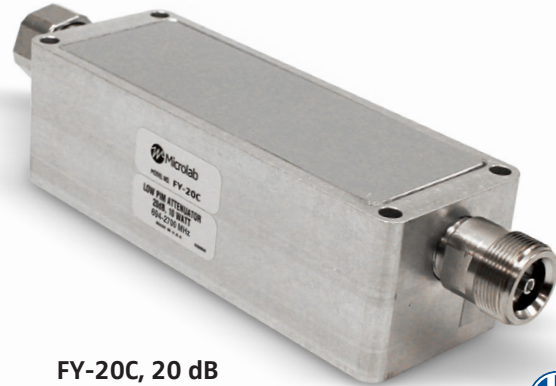
FY-20C, 20 dB Low PIM Attenuator