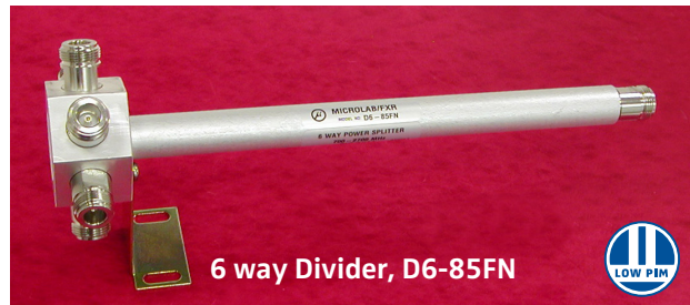
Six Way Outline