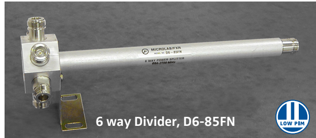
Six Way Outline