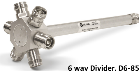
6 way Divider, D6-85FE