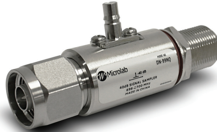
DN-99NQ - Model shown