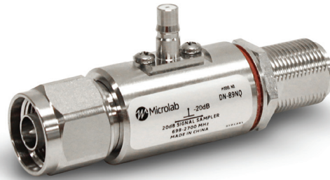
DN-89NQ - Model shown