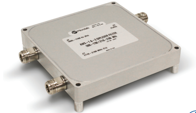
AWS Duplexer BL-51N